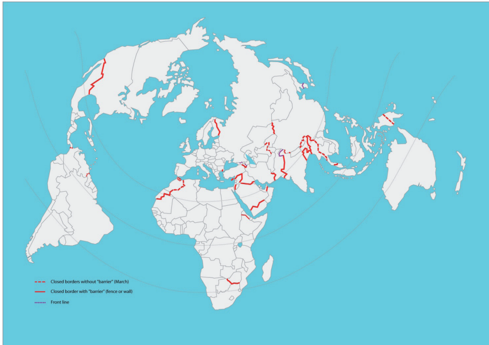
Figure N° 1 Mapping closed international borders

while Japan is protected by the sea). As the French writer Jean-Christophe Rufin observed at the beginning of the 1990's: the 'Empire' is erecting a new Limes against the 'new Barbarians' (Rufin 1991).